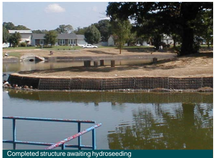
Completed structure awaiting hydroseeding