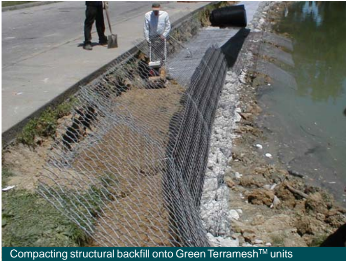
Compacting structural backfill onto Green Terramesh™ units