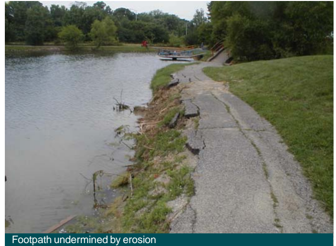
Footpath undermined by erosion