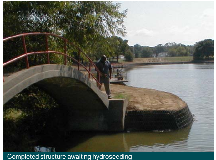
Completed structure awaiting hydroseeding