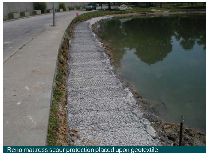
Reno mattress scour protection placed upon geotextile