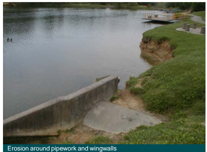
Erosion around pipework and wingwalls