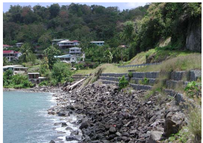
Completed structure - Gouyave to Union