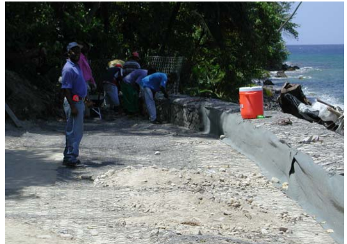
Placing backfill to Terramesh® units

2000 - 2003 ; FOUR PHASES OF CONSTRUCTION