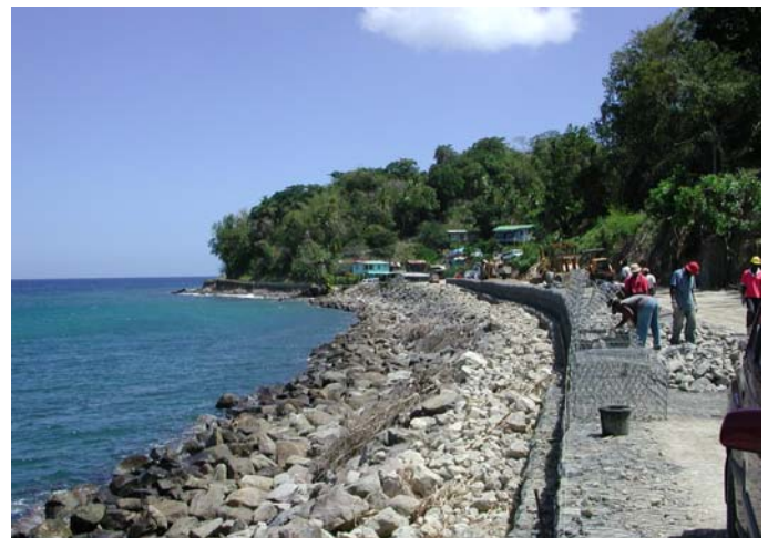
Placing rock fill into Terramesh® facing units