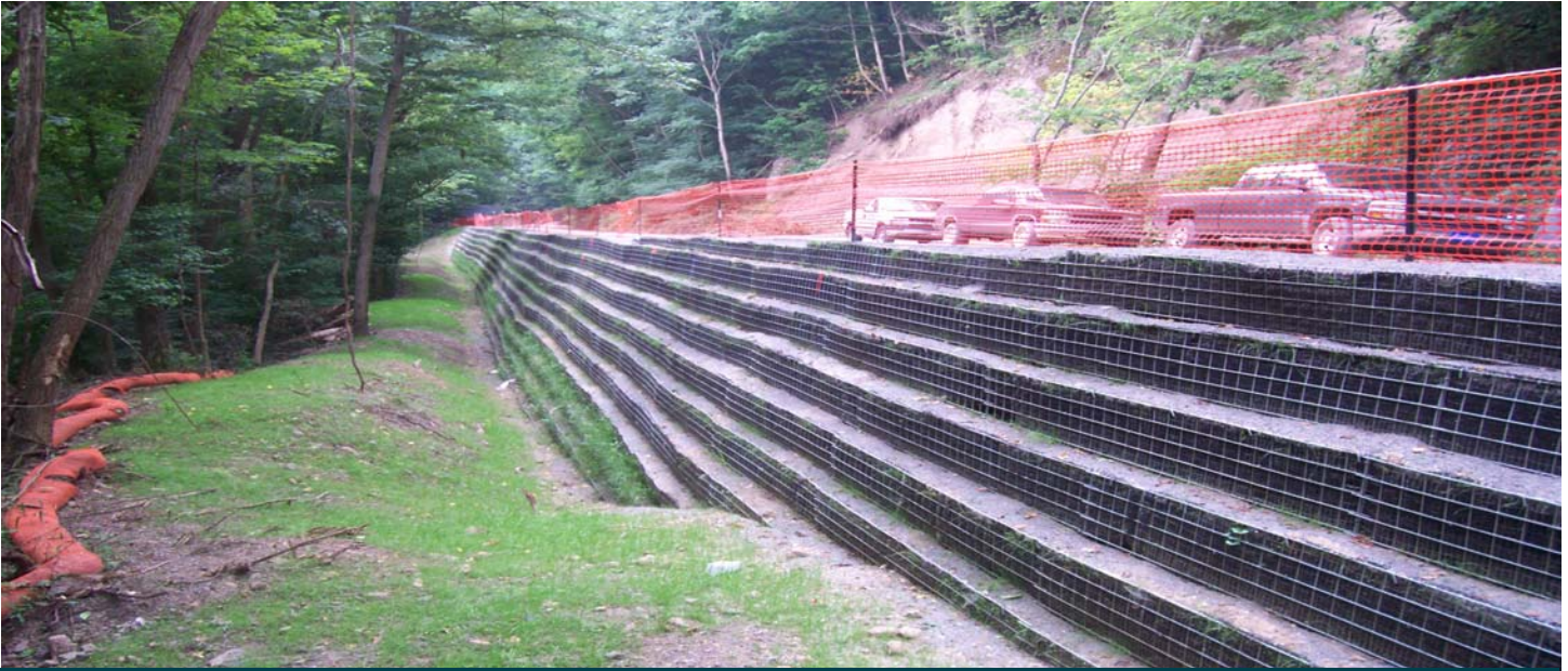
Completed Wall — Awaiting Guardrail