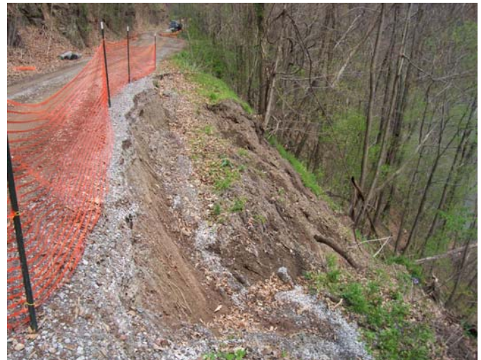
Slope Failure—7 Total Slide Areas