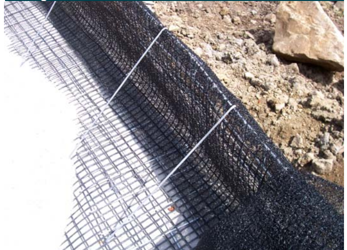
Wrapped Grid Face with MacMat TRM