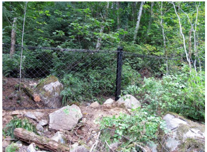
Recent View of the Structure