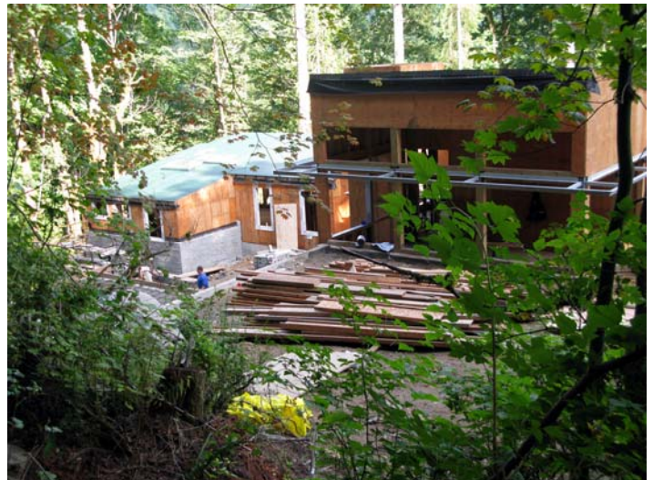
Construction of Johnson Residence